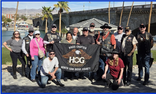
Laughlin Overnight Trip February