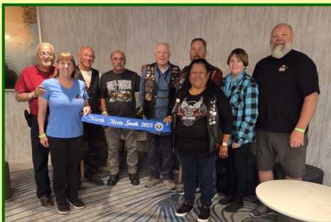
North Meets South Long Distance Trip May