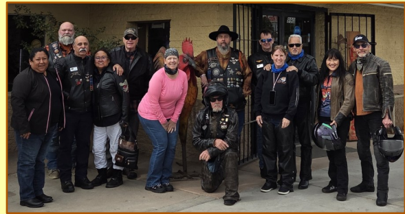
Cottonwood Long Distance Trip March