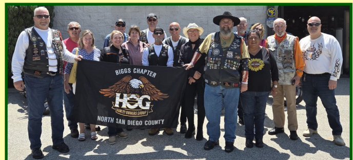
Solvang Overnight Trip July