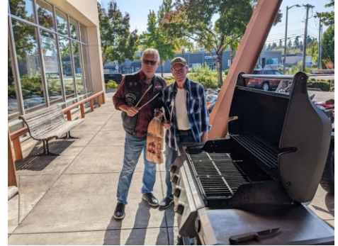
HOT DOG SATURDAY COOKING