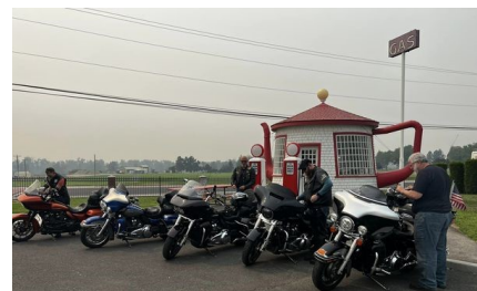
ZILLAH TEAPOT RIDE