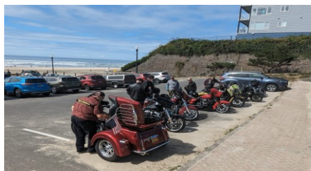
NEWPORT CHOWDER RIDE