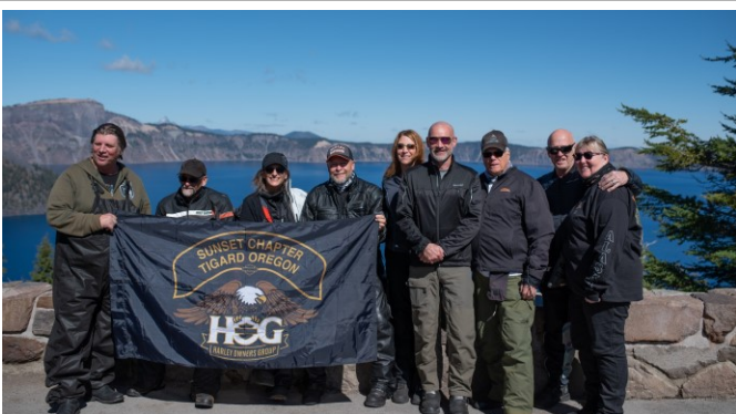
EASTERN OREGON RIDE