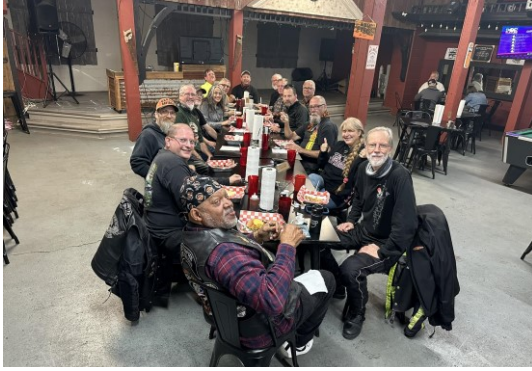
NOT-MT ST HELENS RIDE