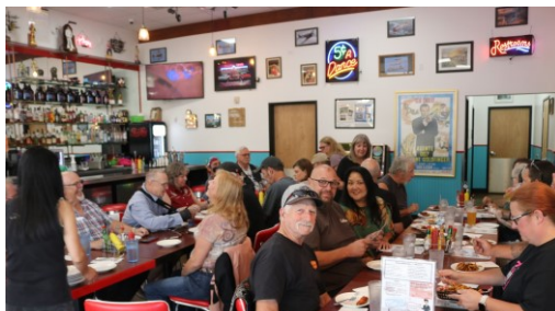
SEPTEMBER MEET & MINGLE