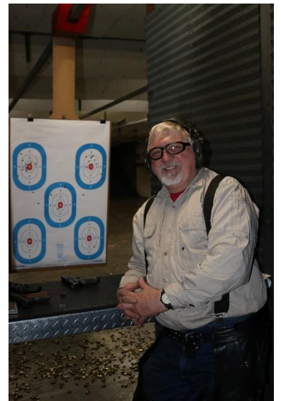
Practice Shoot 2