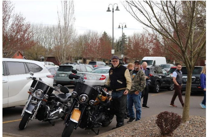
March Meet & Mingle 1