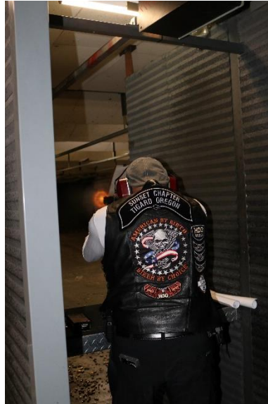
Practice Shoot 3