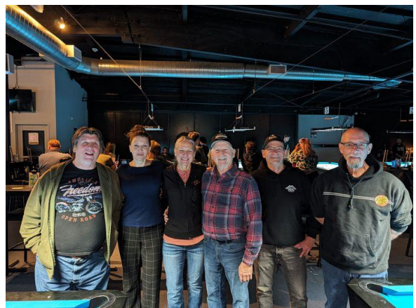
Figure 2 Billiard's Night