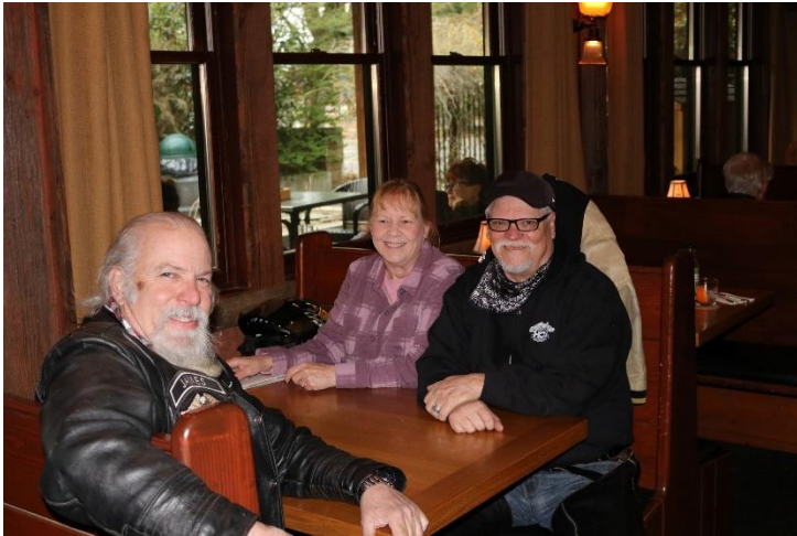
March Meet & Mingle 2