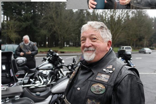
Road Captains' Training