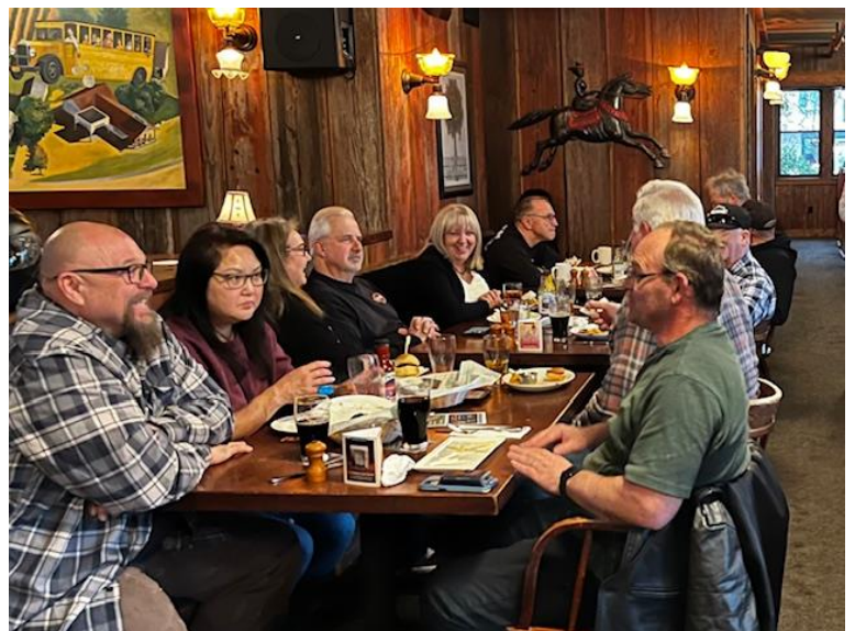
March Meet & Mingle 5