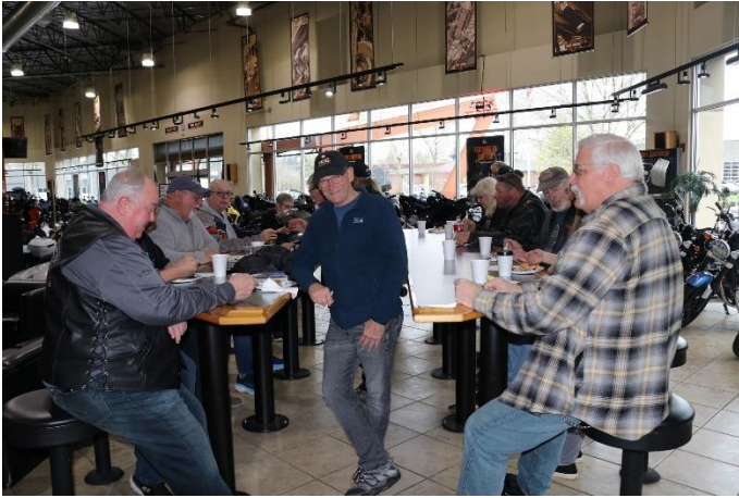
March Potluck 1