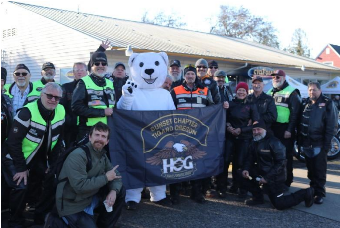
Polar Bear ride 1