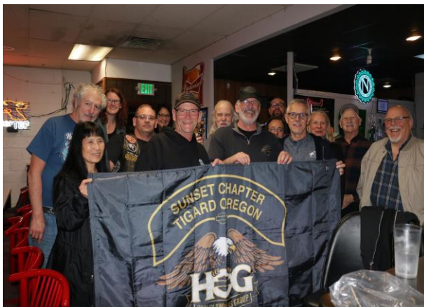
Figure 1 Bowling Night

If you have suggestions for activities you want to do, please email me at Phil@sunsethog.com