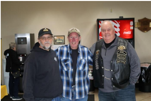
March Potluck 4