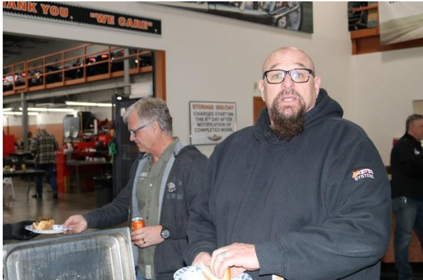
Beer & Brats Paradise Style 3