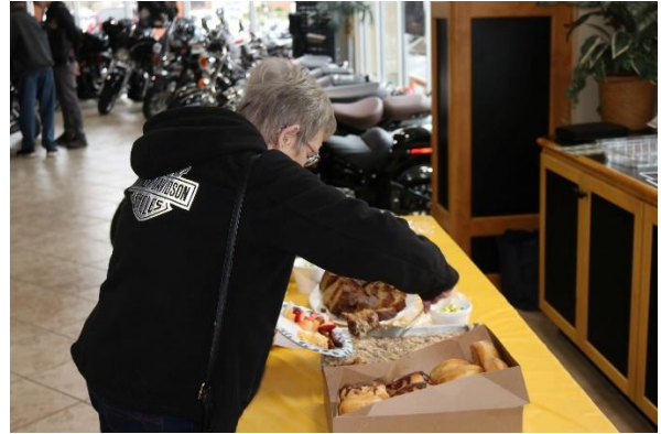
March Potluck 2 and 3