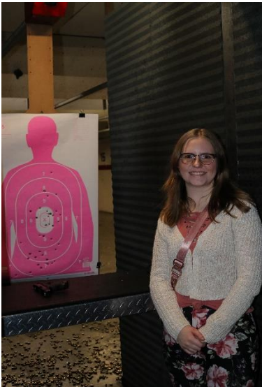
Practice Shoot 1