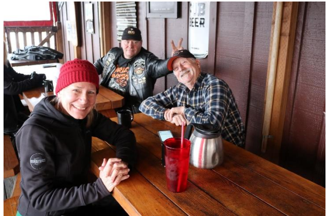
Polar Bear ride 2