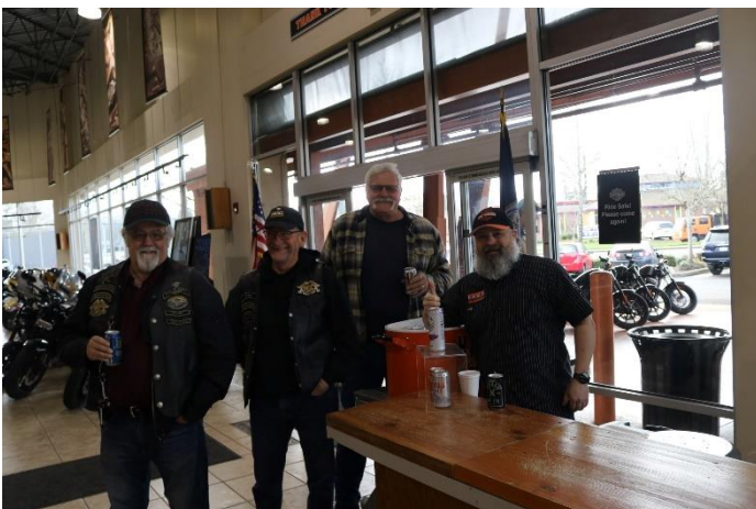
Beer & Brats Paradise Style 1