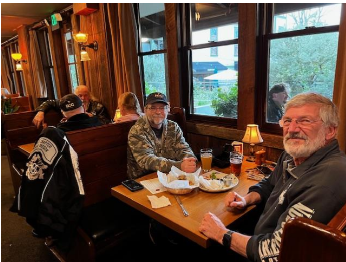
March Meet & Mingle 5