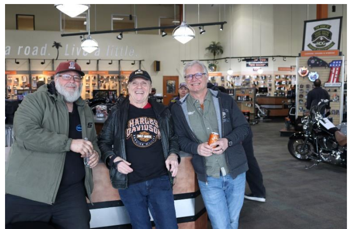
Beer & Brats Paradise Style 2