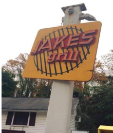
Best BBQ in Maryland Ride, May 13, 2026

Comments: Annual event with MDAMRA, held in Ocean City, MD. It's a get together between the HOG Chapters of Maryland and Delaware. The room block is available under "Biker Bash" for the discounted rate.