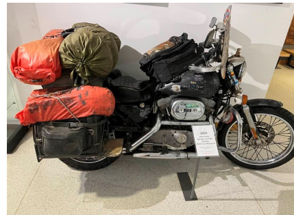
How Tim packs for an overnight ride