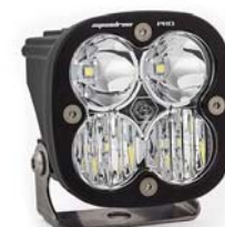
Baja Designs Squadron Pro.