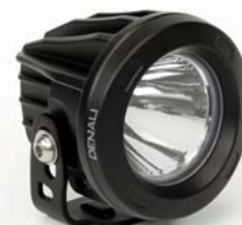
Denali Electronics DR1.