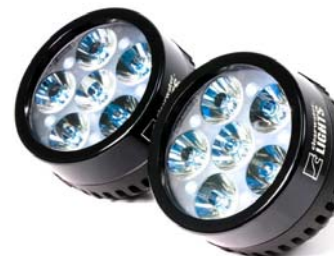
Clearwater Lights Ericas.