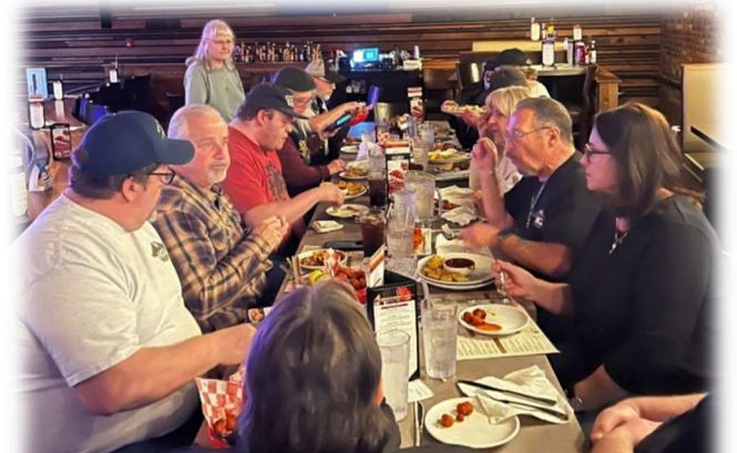
March HOG Night Out