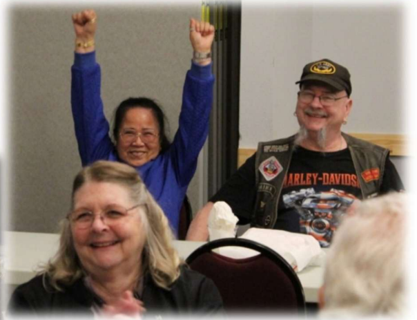
Winner of the 50-50 Raffle!