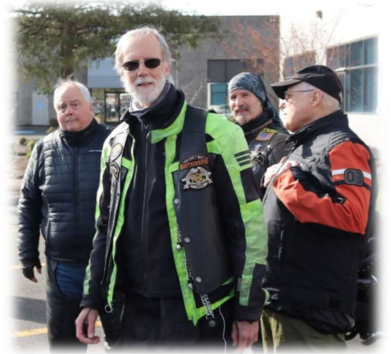
Rib Roast Ride