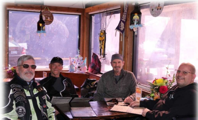
Road Captains Lunch