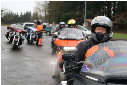
Road Captain Evaluations happen rain or shine.