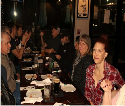
Always a good time at our Meet & Mingles.