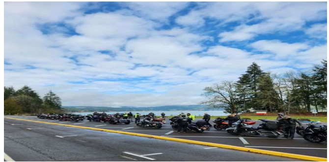
March 11 th - Rib Roast Ride