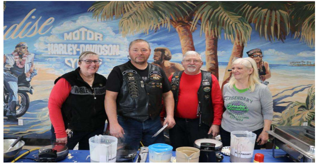
The Officers Waffle Breakfast is always a big hit.