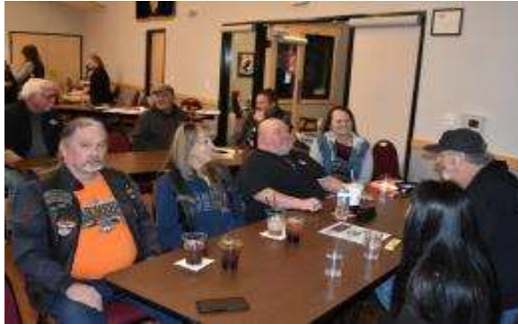
Chapter Meeting at the Beaverton Elks