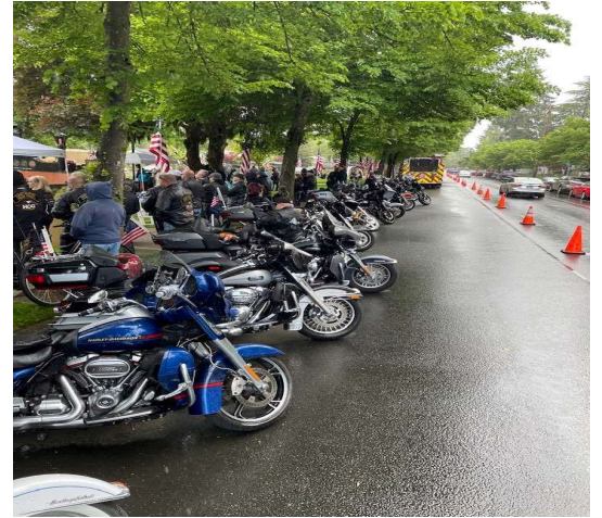
Memorial Day Ride