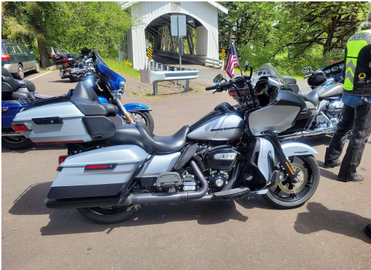
Covered Bridges Ride