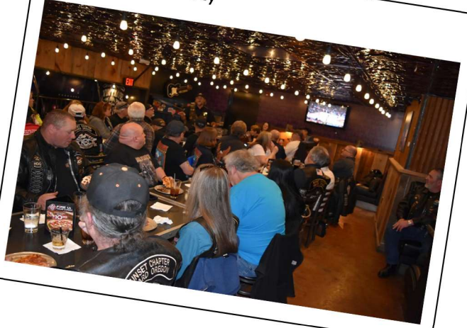
Ride 365 Pizza Party